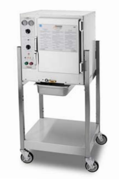
S6 Stand Mounted Steam'N'Hold™ Steam Cooker with optional 4" drain pan