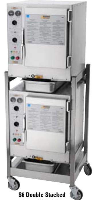
S6 Double Stacked Steam'N'Hold™ Steam Cookers shown with double stack stand (with casters) and 4" drain pans