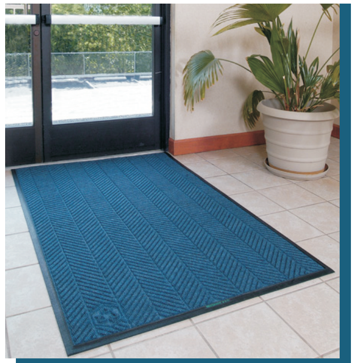
WATERHOG ECO ELITE