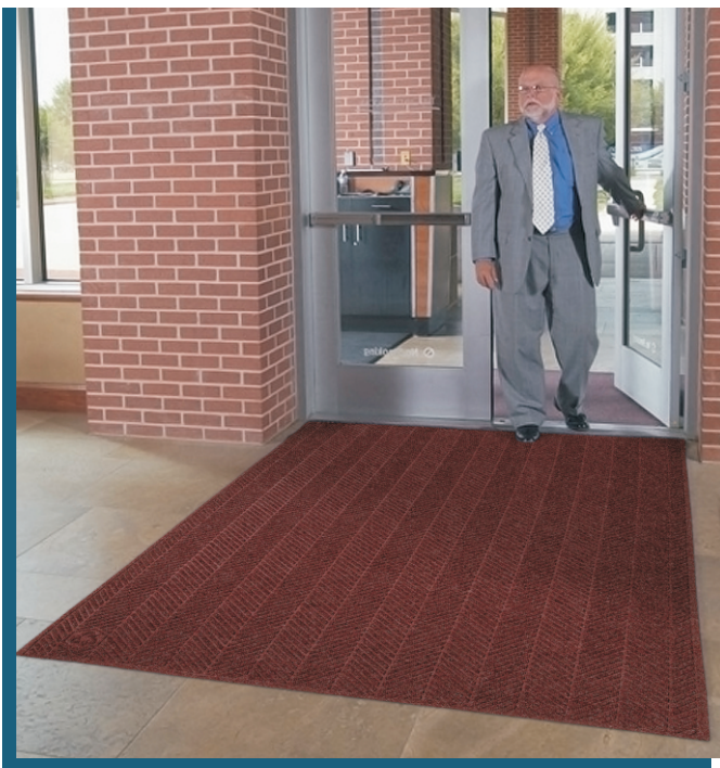
WATERHOG ECO ELITE FASHION