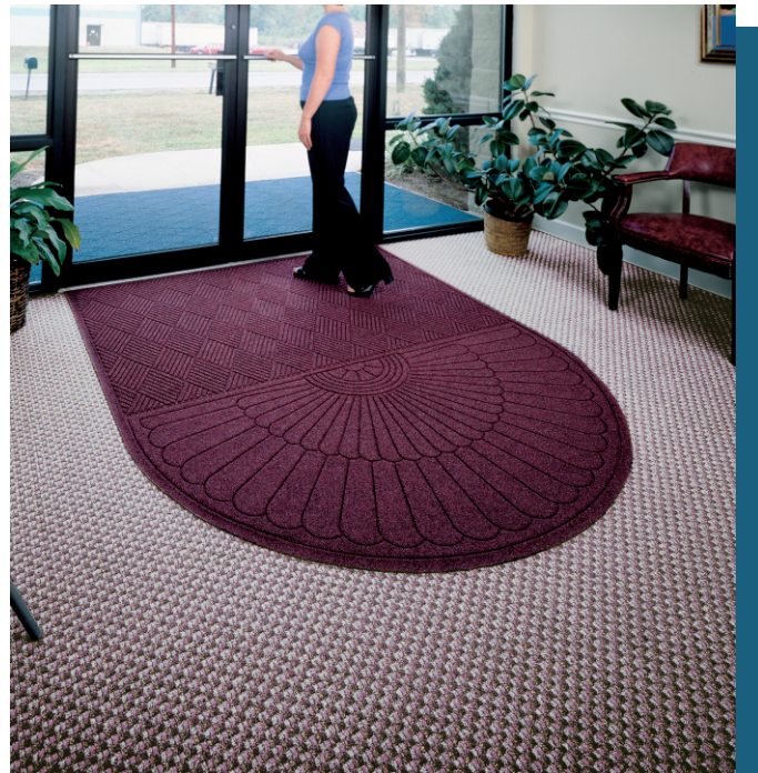
WATERHOG ECO PREMIER FASHION