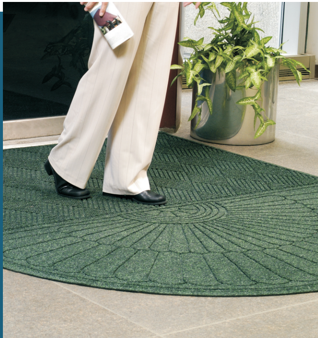
WATERHOG ECO PREMIER