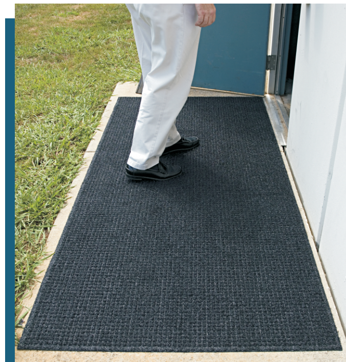
BRUSH HOG PLUS