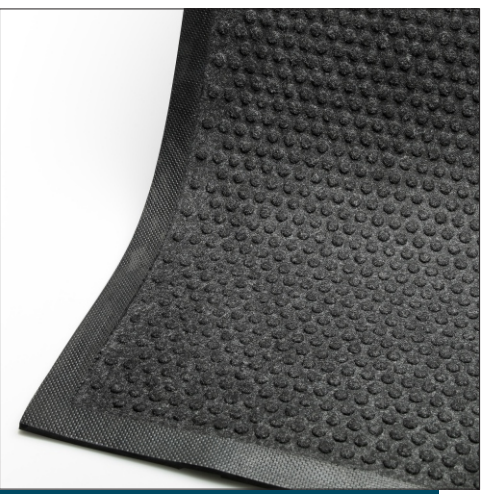
Disk Pattern for Hard Surfaces