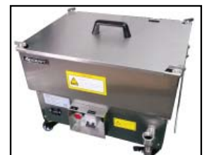
Oil Filter shown with stainless steel cover (included)

Warranty: This product is protected by Admiral Craft Equipment Corporation's 1 year limited warranty. Should your product fail under normal use it will be repaired or replaced up to 1 year from date of purchase.