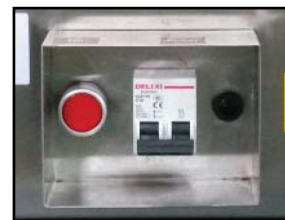
Separate "power" and "pump" controls