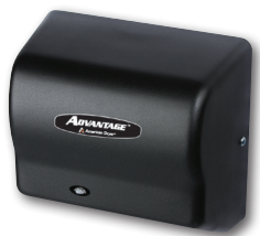
Steel Black Graphite