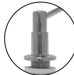
Hand pump soap dispensing activator