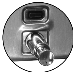
Push button soap dispensing activator