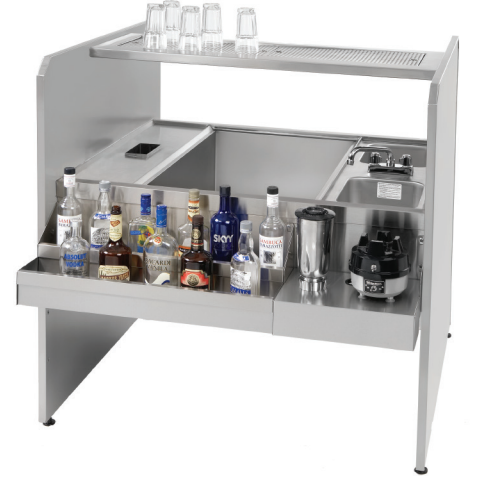
CR-46X36SP-7-L Series Shown

NOTE: To determine left or right hand model, Ice Bin is either Left (L) or Right (R) of the sink from the bartender side.