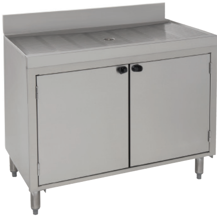
With Optional Hinged Doors