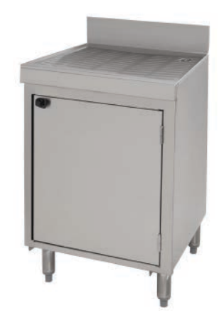
w/ Mid-Shelf & Door CRD-2BMD Shown