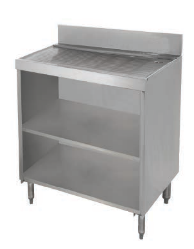
Open Base w/ Mid-Shelf CRD-30BM Shown