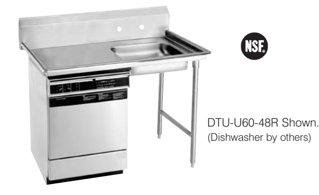
Table is furnished with 10-1/2" splash with a 2" return.