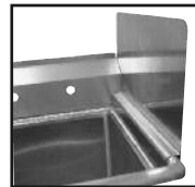
K-700 Removable Side Splashes Fits Left OR Right Side