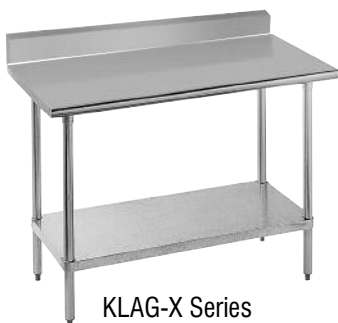
KLAG-X Series 5" Backsplash