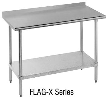
FLAG-X Series 1 1/2" Backsplash