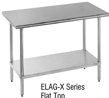
ELAG-X Series Flat Top