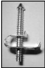
STANDARD MOUNTING CLIPS Accomodates Countertops up to 2" Replacement # K-28 (Per Sink)

Unit punched with 1-3/8" dia. faucet holes.