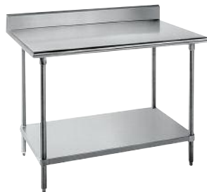
KMSLAG-X Series 5" Backsplash