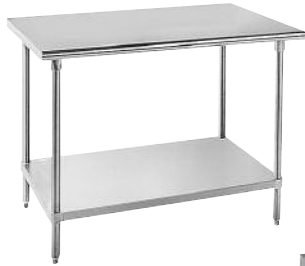
MSLAG-X Series Flat Top