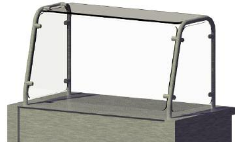
CAFETERIA STYLE 19" Standard Front Glass Height

*3/8" Thick Heat-Tempered Glass Required For Front