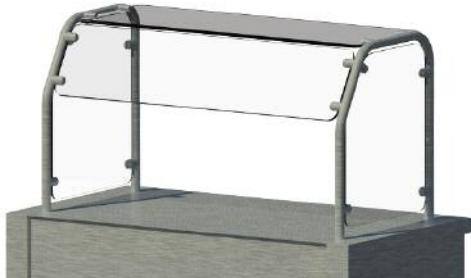
SELF-SERVE STYLE 8" Standard Front Glass Height