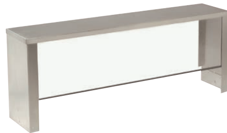
10" Wide Serving Shelf With Built-In Food Shield