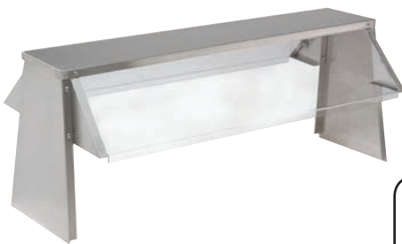
10" Wide Buffet Shelf With Built-In Food Shield