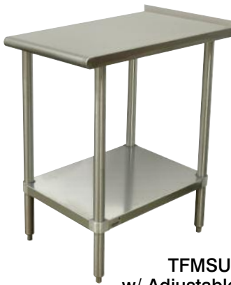
TFMSU Series w/ Adjustable Undershef