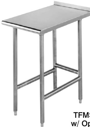
TFMS Series w/ Open Base