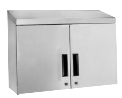
HINGE DOORS (Shown with Optional Door Lock)