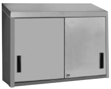
SLIDING DOORS (Shown with Optional Door Lock)