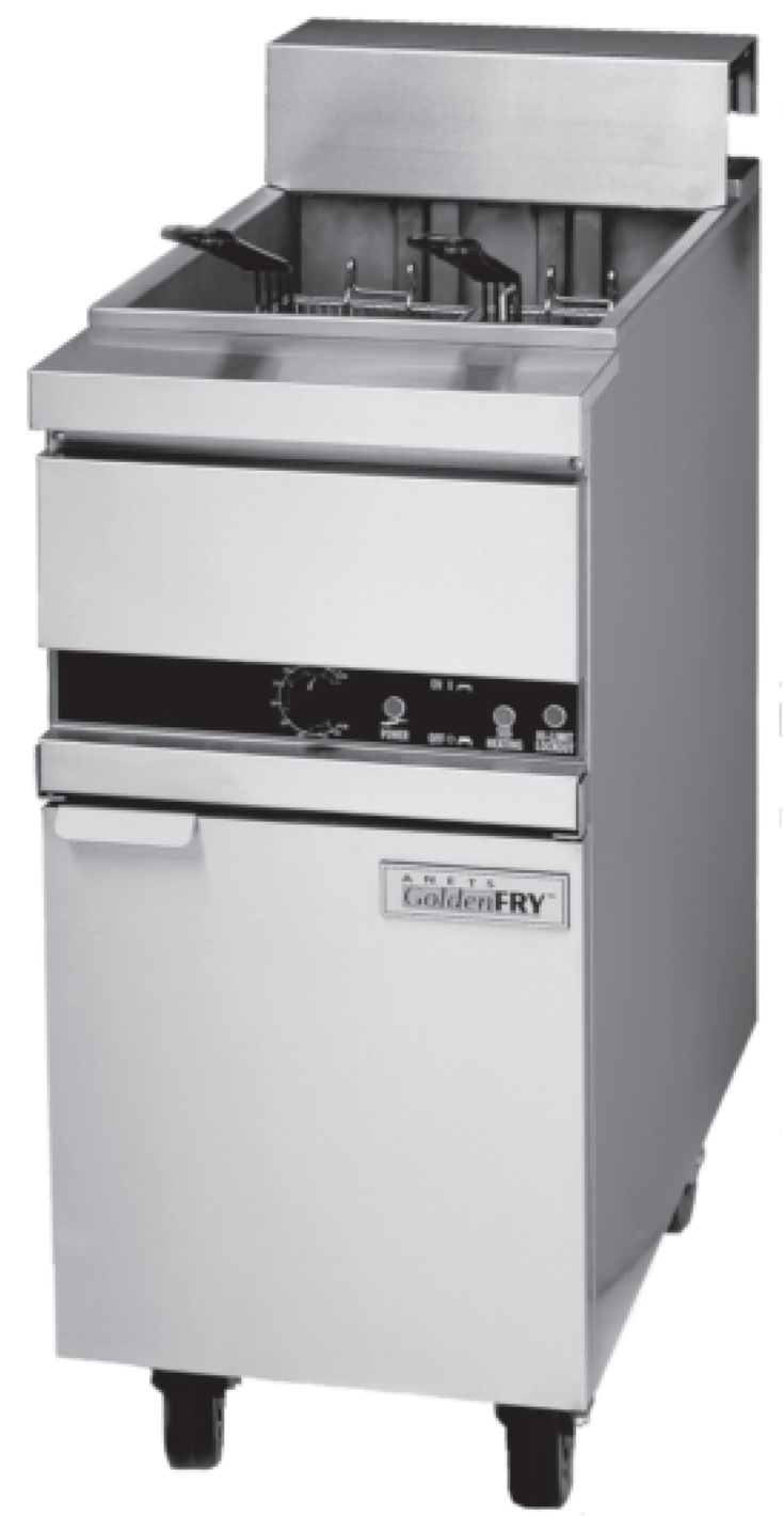
Model 14EL - 17 shown with optional casters