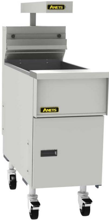
AHBNB18 with optional food warmer and casters

To be used with the Anets Fryer line. Unit can be installed on either side or between fryer(s). Design to match existing or accompanying fryers. Pan area allows for holding and draining of finished product. Drain screen easily lifts out for cleaning. Bottom Shelf provides ample storage for breading, batter, food utensils, etc. *Bottom Shelf is not provided when a filter pump or flush hose is located inside the dump station.