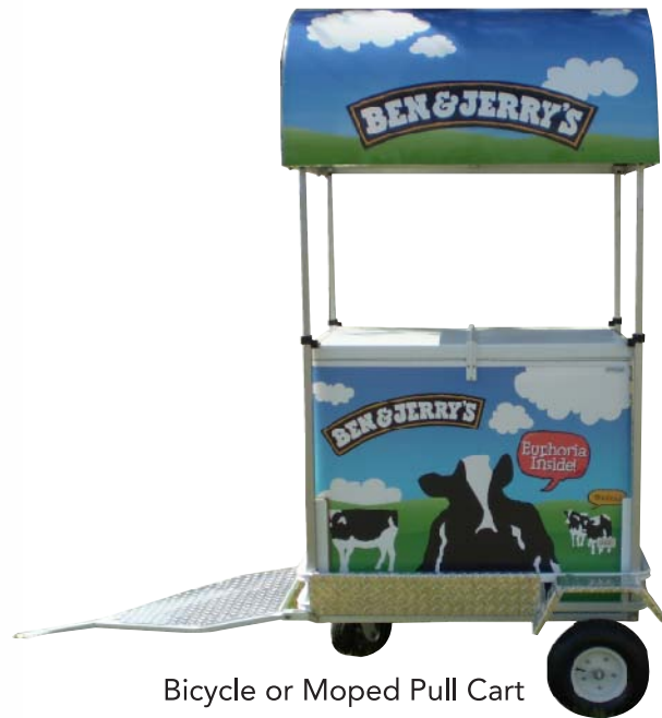
Bicycle or Moped Pull Cart