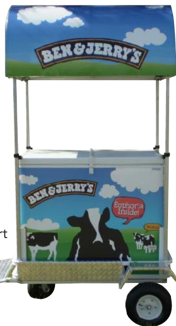
6FFE Pull Cart