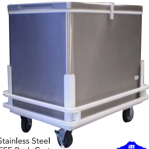
Stainless Steel 6FFE Push Cart

Description: Eutectic Cold Plate Push Cart Freezer