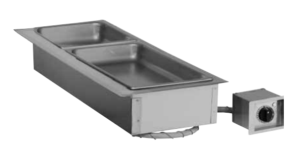
100-HW/D443 (Pans not included)