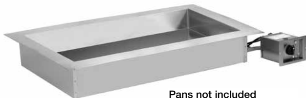
Pans not included

• The gentle heating capability of HALO HEAT significantly extends hot food holding life without continuing the cooking process.