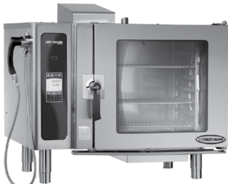
MODEL 6•10esG WITH COMBITOUCH CONTROL CAPACITY OF SIX (6) FULL-SIZE OR GN 1/1 PANS, SIX (6) HALF-SIZE SHEET PANS