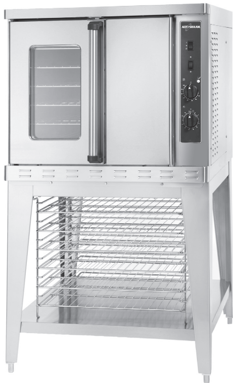
ASC-4G WITH OPTIONAL STATIONARY OVEN STAND AND PAN RACK WITH SHELVES - 5003489