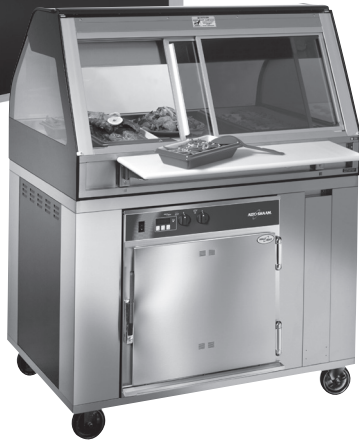
EU2SYS-48 BACK VIEW SHOWN WITH 750-TH-II COOK & HOLD OVEN AND OPTIONAL CASTERS