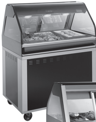
EU2SYS-48 FRONT VIEW SHOWN WITH OPTIONAL CASTERS