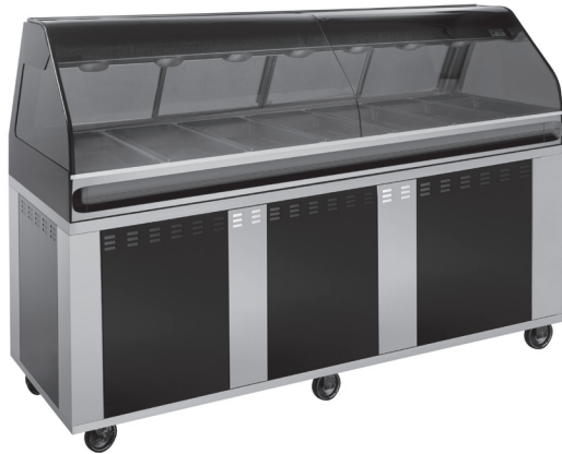
EU2SYS-96 FRONT VIEW SHOWN WITH OPTIONAL CASTERS

The display case is constructed of 18 gauge, non-magnetic stainless steel. A curved, tempered glass front encloses the display case and can be lifted to a 90 degree angle for easy cleaning. Removable, sliding glass doors on the operator side are included. Sliding door tracks have a "clean sweep" cutout allowing for easy cleaning and crumb removal. Framed end clear glass with rubber gasket material protects glass edges from chipping and breakage. The base is divided into three (3) individually managed heat zones with each zone controlled by a separate thermostat with a range of 1 through 10 and heat-on indicator light. Overhead lights are controlled by ON/OFF switches in three (3) light zones. Two (2) 125V plug outlets are available as an option on 120/208-240V units only. Decorator base includes one set of leveling bolts.