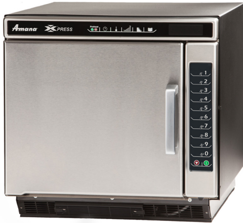
Model ACE14N shown