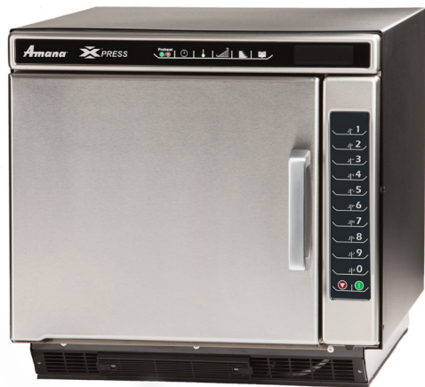
Model ACE14V shown