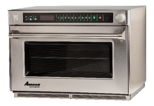
Model AMSO22 shown