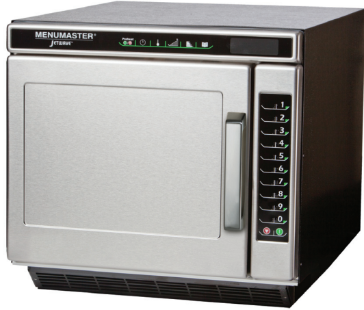
Model JET14 shown