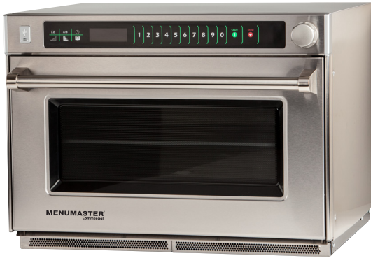
Model MSO22 shown