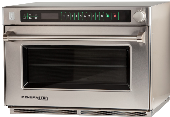
Model MSO35 shown