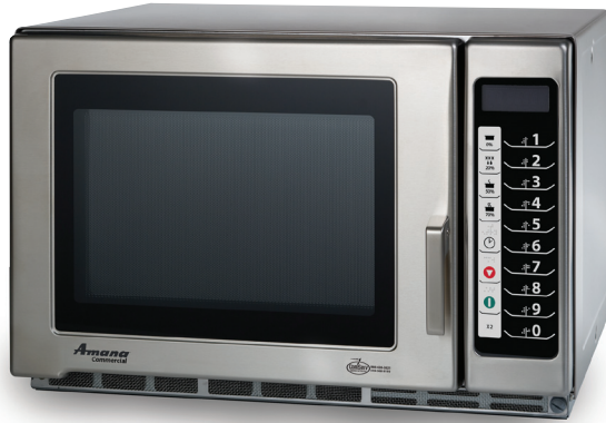
Model RFS18TS shown