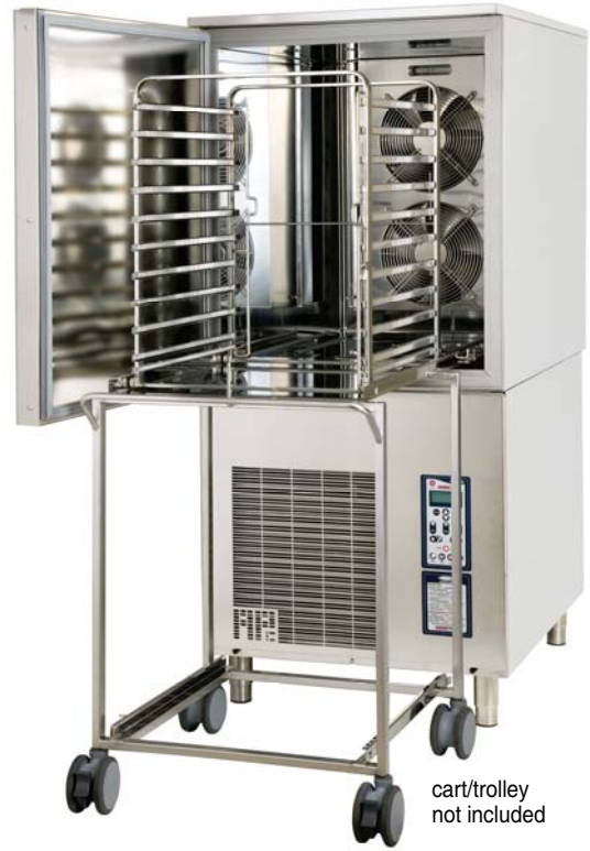
cart/trolley not included