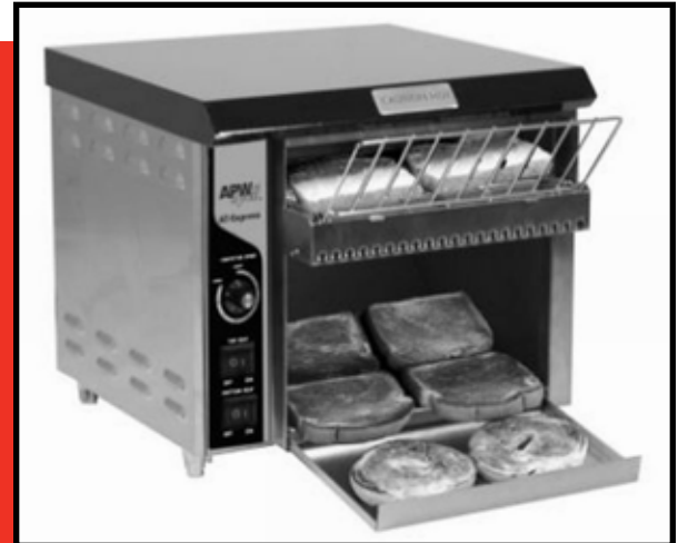
AT EXPRESS RADIANT CONVEYOR TOASTER