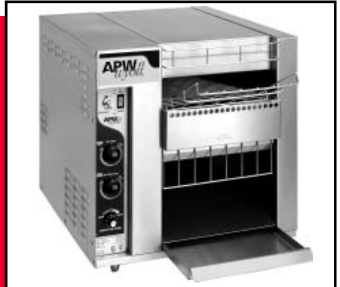
MODEL BT-15-2 CONVEYOR TOASTER