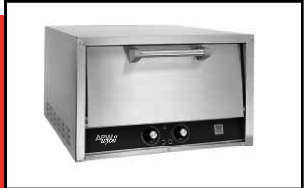
Countertop Deck Oven

Unit construction offers stainless steel top, sides, and door liner with an aluminized steel oven liner and stainless steel door liner. The unit is insulated on all sides. Oven compartments has two ceramic phosphate decks 16 3/8" x 16 7/8" which are removable to allow for easy cleaning. Decks are 3-1/2" apart. Oven's thermostat range is 300F– 500F and includes a 15 minute timer. Thermostat controls three sheath-type electric elements. The locations of the three elements are: one under each deck and one at the inside top of the oven