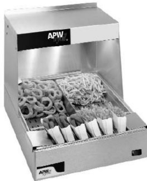
Model: Countertop Fry Holding Station CFHS-21