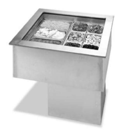
Model: Drop-In Cold Well