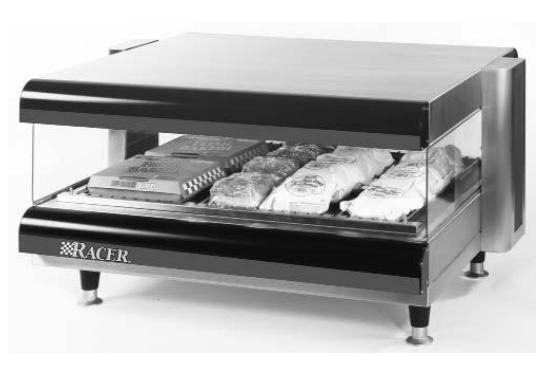
Model: Racer™ Horizontal Open Air Heated Merchandisers