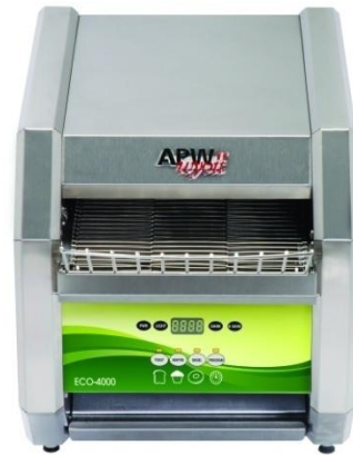
Model ECO 4000 350E

*Warranty does not include rock grates, cooking grates, burners shields or fireboxes.