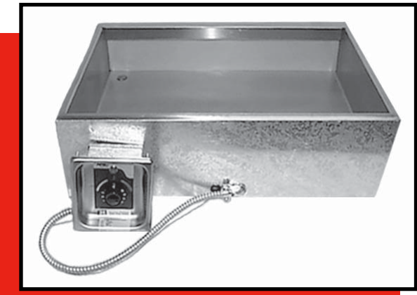
Insulated Bottom Mount Hot Food Well FW-2026