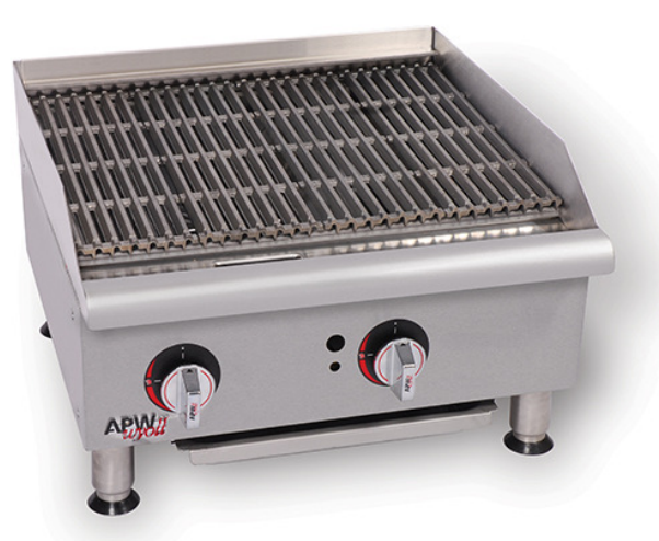
Model GCRB-24i Gas CharRock CharBroiler