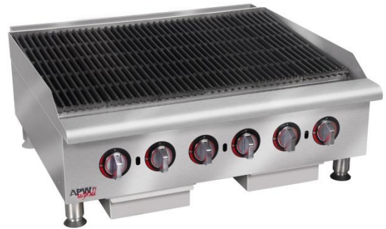
Model HCBR-2424i Heavy Duty Flat Hot Plate

*Warranty does not include rock grates, cooking grates, burners shields or fireboxes.