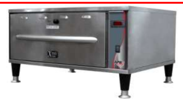
Model: HDXi-1 Countertop Holding Drawer