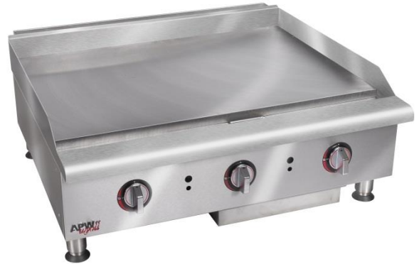
Model HMG-2424i Heavy Duty Manual Griddle

*Warranty does not include rock grates, cooking grates, burners shields or fireboxes.